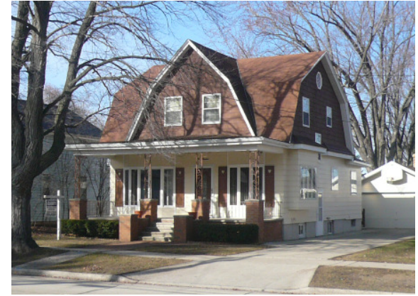
Table 1.10: Summary of Housing Based on Side of River